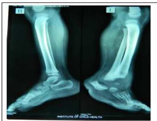
Figure 4: Erosion of bones around left ankle