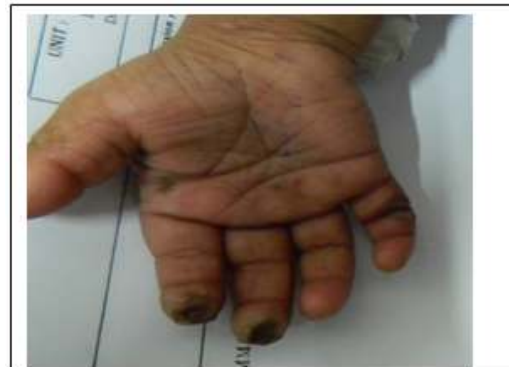
Figure 2: Evidence of self-mutilation

Pilocarpine iontophoresis did not produce any sweat in the child. Skin biopsy and sural nerve biopsy were planned, but not done as CIPA was a clinical diagnosis.