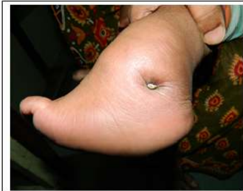
Figure 3: Charcot joint