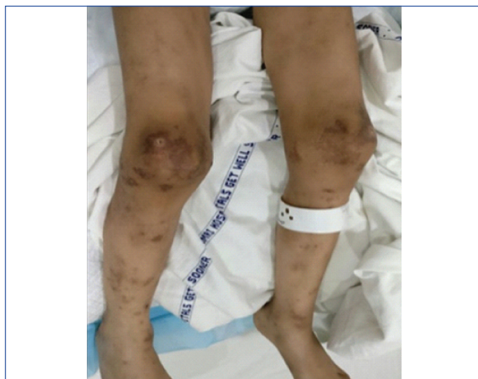
[Table/Fig-1]: Hyperpigmented and desquamated patches all over the body.